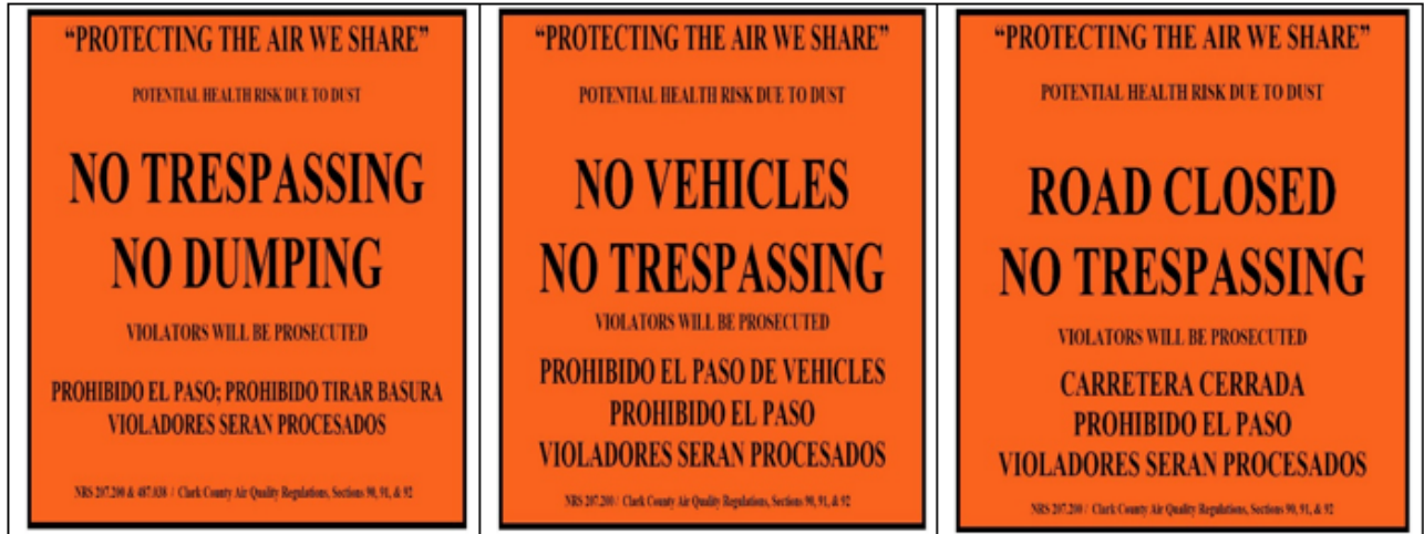
Figure 1: Examples of Signage

Note: The appropriate Control Measure for the project soil type must be selected from Table 1.